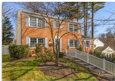
10803 McComas Ct Kensington/Kensington Heights Under Contract - $759,000