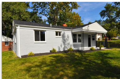
3400 Rutgers St Hyattsville/University Hills Coming Soon