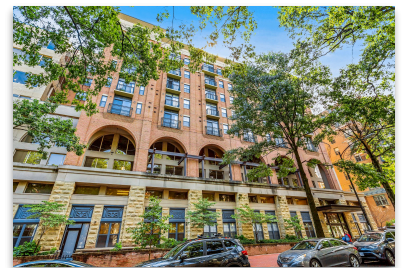
1111 25th St NW #806 Washington DC/ West End Sold - $750,000