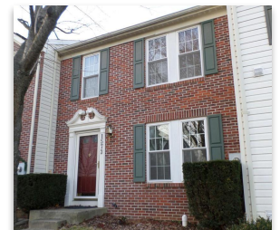
1573 Beverly Ct * Frederick/Fredericktowne Village Sold - $257,000