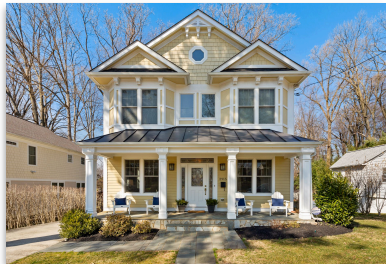
2915 Jennings Rd Kensington/Oakland Terrace For Sale - $1,059,000