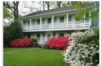
3300 Wake Dr Kensington/Rock Creek Hills For Sale - 850,000