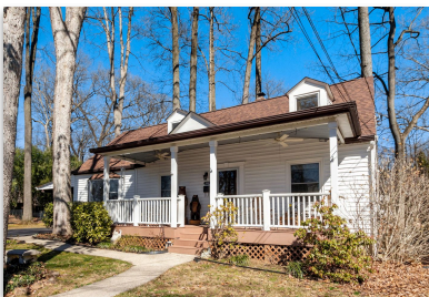
3303 Oberon St Kensington/Homewood For Sale - $769,000