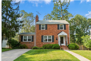
2713 Emmet Rd * Silver Spring/Oakland Terrace Sold - $603,000