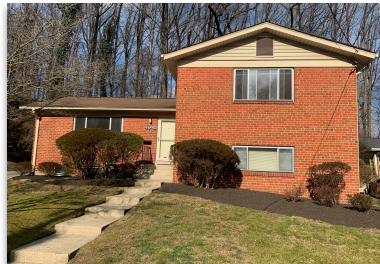
4005 Woodlawn Rd Chevy Chase / CC Sec. 9 Sold - $860,000