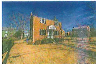
4413 Puller Dr Kensington/Kensington Estates Under Contract - $679,000