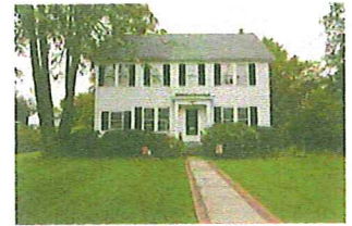
3904 Dresden St Kensington/Chevy Chase View Under Contract - $739,000