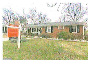
*6214 Hollins Dr Bethesda/Ashburton Sold - $805,750