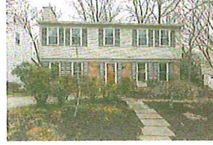
10103 Day Ave Silver Spring/Capitol View Park Under Contract - $595,000