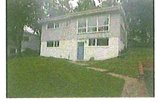
3917 Denfeld Ave Kensington/Rock Creek Palisades Sold - $550,000