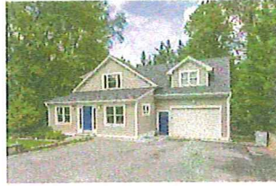
3005 Oak Dr Kensington/Kensington View Active - $719,000