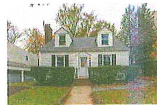
10206 Grant Ave Silver Spring/Capitol View Park Sold - $520,000