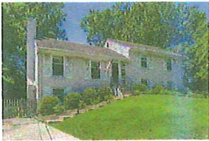
4014 Dunnel Ln Kensington/Byeforde Active - $799,000