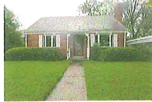
4206 Brookfield Dr. Kensington/Kensington Estates Under Contract - $579,000