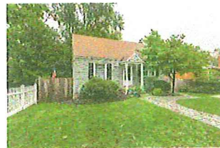
11015 Glueck Ln Kensington/North Kensington Sold - $455,000