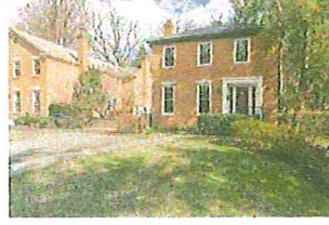
10005 Kensington Pkwy Kensington/Kensington Sold - $910,000