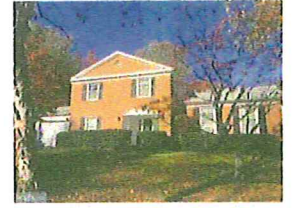
*2 Sussex Ct Rockville/Potomac Woods Sold - $579,900