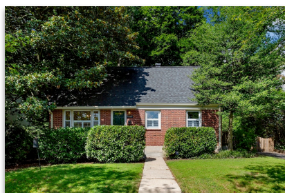
11200 Mitscher St Kensington/Rock Creek Palisades Under Contract - $679,000