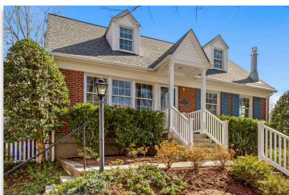
3918 Spruell Dr Kensington/Rock Creek Palisades Sold - $740,000