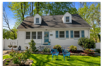
4111 Byrd Ct Kensington/Rock Creek Palisades Sold - $650,000