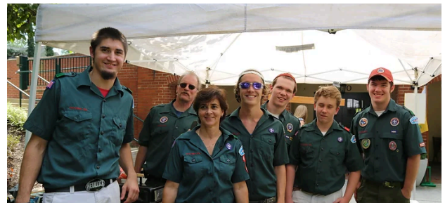
Troop 439 Scouts at the Train Show Hot Dog stand in 2021

Be sure to visit www.kensington439.mytroop.us . and for more information contact Scoutmaster Tucker Echols at scoutmaster439md@gmail.com .