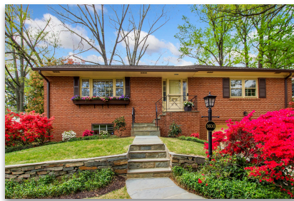
9600 E. Bexhill Dr Kensington/Rock Creek Hills Sold - $1,150,000