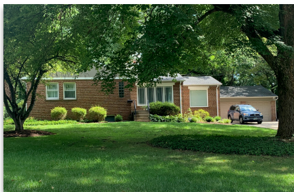
3620 Saul Rd * Kensington/Rock Creek Hills Sold - $1,100,000