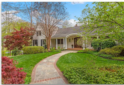
9541 E. Bexhill Dr Kensington/Rock Creek Hills Sold - $1,995,000