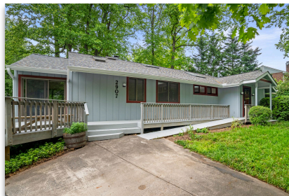
2907 Woodstock Ave Silver Spring/Forest Glen Park Sold - $935,000