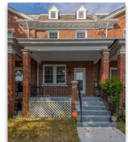
47 Hamilton St NW * Washington DC/Petworth Sold - $825,000