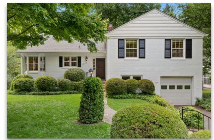
9910 Old Spring Rd Kensington/Rock Creek Hills Active - $1,149,000