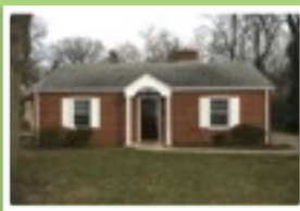
4115 Warner Street Kensington/Warner's Kensington $ 465,000