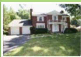
9707 Old Spring Road Kensington/Rock Creek Hills $ 1,175,000