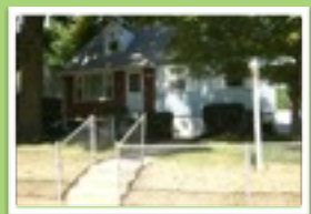
4009 Spruell Drive Kensington/Rock Creek Palis $ 399,000