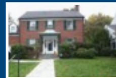
7812 STRATFORD RD Bethesda - Wheatley Hills SOLD - $ 845,000