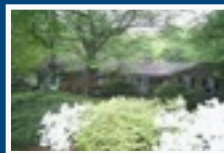
6600 LYBROOK COURT Bethesda - Lybrook SOLD - $ 1,187,500