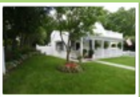
3414 Wake Drive Kensington/Kensington $ 589,000