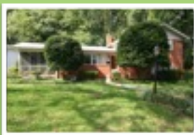
8912 Spring Valley Road Chevy Chase $ 719,000