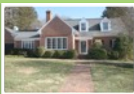
9705 East Bexhill Drive Kensington/Rock Creek Hills please check website for price