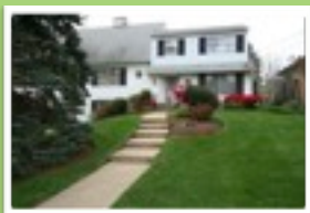
9704 Hillridge Drive Kensington/Rock Creek Hills $ 899,000