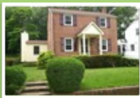
4304 Ambler Drive Kensington/Kensington Est $ 575,000