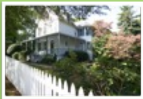
3947 Baltimore Street Kensington/Kensington $ 1,250,000