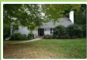
9707 Cedar Lane Bethesda/Rock Creek Highlands $ 765,000