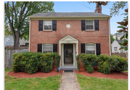
4104 Knowles Ave Kensington/Warners Addition Active - $875,000