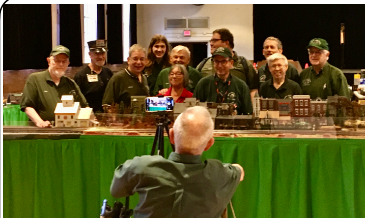
Happy Trackers pose for Michael Fistere after the Train Show