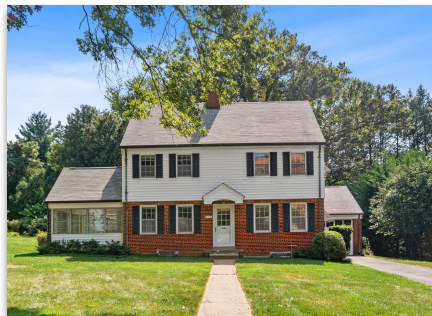
9712 Elrod Rd Kensington/Rock Creek Hills Sold - $1,000,000