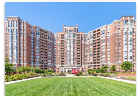
5809 Nicholson Ln #16 Rockville/The Wisconsin Active - $349,000