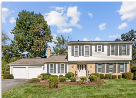
7813 Ivymount Terrace Potomac/Willerburn Acres Under Contract - $1,250,000