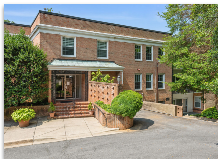
3535 Chevy Chase Lake Dr #106 Chevy Chase/Hamlet House Active - $489,000