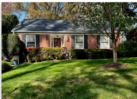
10006 Frederick Ave Kensington/Kensington Active - $829,000