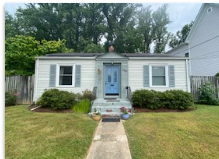
10616 Parkwood Dr Kensington/Kensington Terrace Sold - $760,00