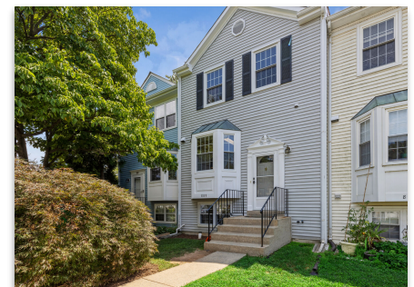
889 Bayridge Dr Gaithersburg/Fernshire Farms Under Contract - $479,000