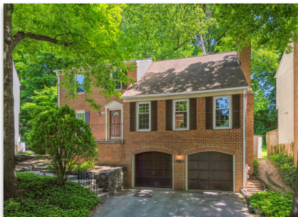
2507 Campbell Pl Kensington/Rock Creek Hills Sold - $875,000