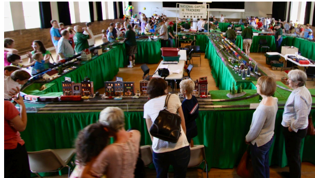
The first Kensington Train Show September 11, 2011

Inside this issue: A Wider Circle's Professional Development Center...Paint the Town Labor Day Show...Artha Rini Indonesian Restaurant...Community Risk Reduction...and more.