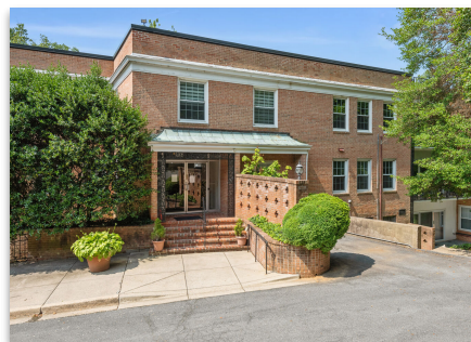
3535 Chevy Chase Lake Dr #106 Chevy Chase/Hamlet House Sold - $535,000