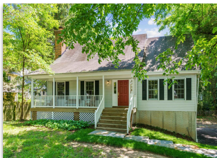
10216 Capitol View Ave Silver Spring/Capitol View Park Sold - $669,000