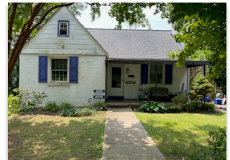
4204 Knowles Ave Kensington/Warners Addition Active - $719,000