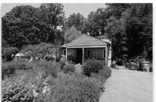
3009 Jennings Road Kensington/Oakland Terrace FOR SALE - $ 307,000