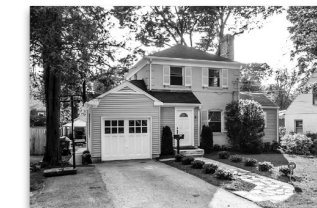
4106 Knowles Avenue Kensington/Warners Add SOLD in JUNE - $ 539,000