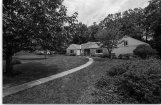
3534 Raymoor Road Kensington/Rock Creek Hills FOR SALE - $ 979,000