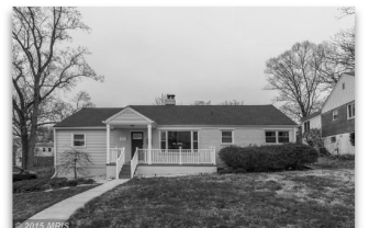
2504 Jennings Road Silver Spring/Stephen Knolls SOLD FOR BUYER JUNE - $ 450,000