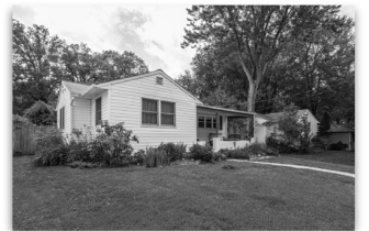
3906 Lawrence Avenue Kensington/Rck Crk Palisades FOR SALE - $ 349,000