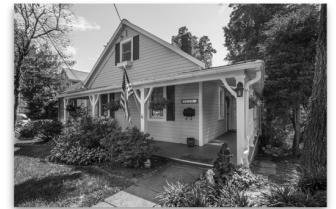
10217 Menlo Avenue Silver Spring/Cap View Park FOR SALE - $ 675,000