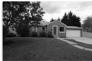
11100 Kensington Blvd Kensington/North Kensington FOR SALE - $ 419,000