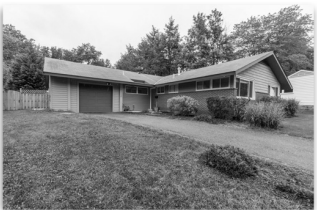
10110 Parkwood Drive Bethesda/Parkwood UNDER CONTRACT - $ 665,000