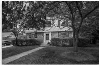
9604 Cable Drive Kensington/Rock Crk Highlands FOR SALE - $ 795,000