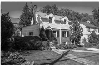
3417 Oberon Street Kensington/Kensington FOR SALE - $ 539,000