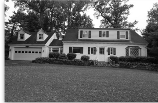
4312 Glenridge Street Kensington/CH CH View FOR SALE - $ 895,000