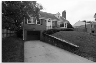
4502 Franklin Street Kensington/Parkwood FOR SALE - $ 714,000