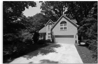
3309 Geiger Avenue Kensington/Kensington View FOR SALE - $ 709,900