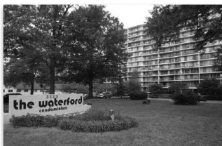
3333 University Blvd # 1106 Kensington/The Waterford FOR SALE - $ 159,000