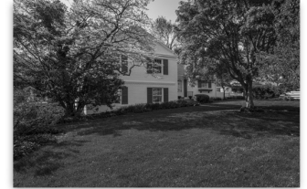
4300 Dunnel Lane Kensington/Rck Crk Highlands UNDER CONTRACT - $ 795,000