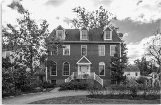
4616 Fairfield Drive Bethesda/Glenbrook Village FOR SALE - $ 1,290,000