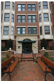
10400 Strathmore Park Ct * N. Bethesda/Strathmore Park Sold - $930,000