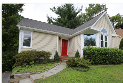
10044 Pratt Pl Silver Spring/Capitol View Park Sold - $575,000