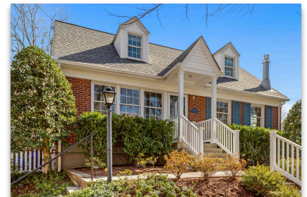
3918 Spruell Dr Kensington/Rock Creek Palisades Active - $690,000