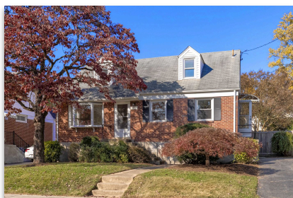
4109 Mitscher Ct Kensington/Rock Creek Palisades Sold - $580,000