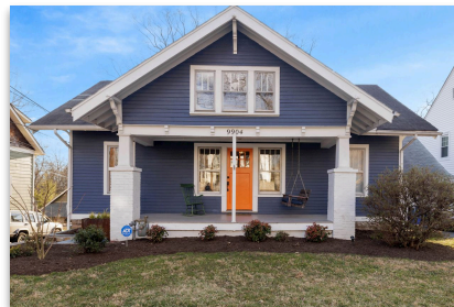
9904 Capitol View Ave Silver Spring/Capitol View Park Active - $720,000