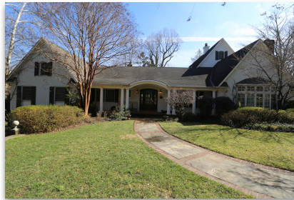
9541 E. Bexhill Dr Kensington/Rock Creek Hills Coming Soon - $2,499,000