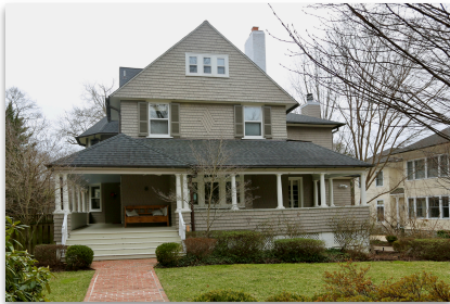
8 Grafton St * Chevy Chase/Chevy Chase Sec. 2 Sold - $3,145,000