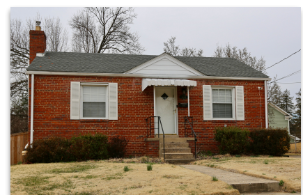
10812 Stella Ct * Kensington/Kensington Heights Sold - $565,000