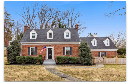
9701 Connecticut Ave Kensington/Larchmont Knolls Active - $1,390,000