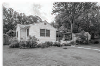
3906 Lawrence Avenue Kensington/Rck Crk Palisades SOLD - 9/30/2015 $ 335,000