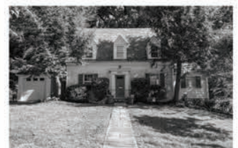
3901 Saul Road Kensington/Rock Creek Hills FOR SALE - $ 664,400