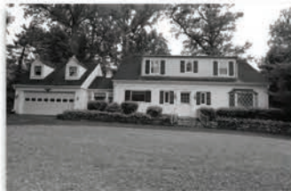
4312 Glenridge Street Kensington/CH CH View FOR SALE - $ 859,000