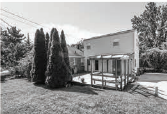
10326 Summit Avenue Kensington/Kensington Estates FOR SALE - $ 650,000