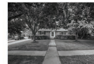
9604 Cable Drive Kensington/Rck Crk Highlands SOLD - 9/15/2015 $ 750,000