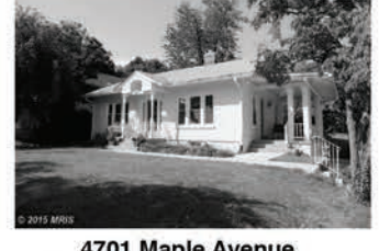
4701 Maple Avenue Bethesda/Rosedale Park For Rent - $ 3,600 a month