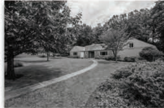
3534 Raymoor Road Kensington/Rock Creek Hills FOR SALE - $ 939,000