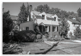
3417 Oberon Street Kensington/Kensington FOR SALE - $ 510,000