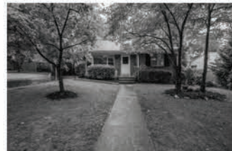
9204 East Parkhill Drive Bethesda/Parkview FOR SALE - $ 725,000