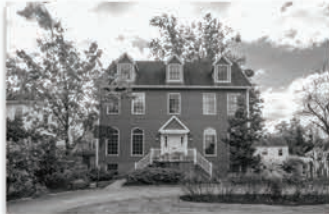
4616 Fairfield Drive Bethesda/Glenbrook Village FOR SALE - $ 1,200,000