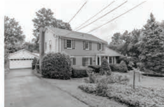
4013 Glenrose Street Kensington/Chevy Chase View FOR SALE - $ 995,000