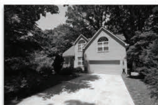
3309 Geiger Avenue Kensington/Kensington View FOR SALE - $ 699,500