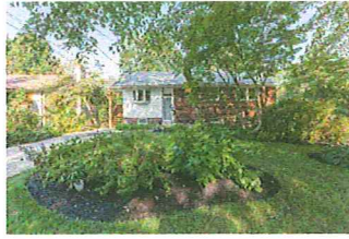
10108 Frederick Ave Kensington/Kensington Active - $ 870,000