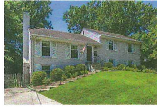
4014 Dunnel Ln Kensington/Byeford Active - $ 859,000