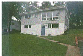
3917 Denfeld Ave Kensington/Rock Creek Palisades Active - $ 550,000