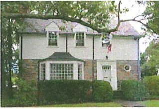
4101 Glenridge St Kensington/Chevy Chase View Sold - $800,000