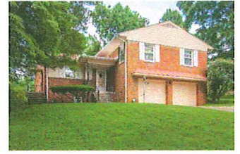
9508 E. Bexhill Dr Kensington/Rock Creek Hills Under Contract List Price - $828,000