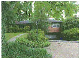
9912 E. Bexhill Dr Kensington/Rock Creek Hills Under Contract List Price - $610,000