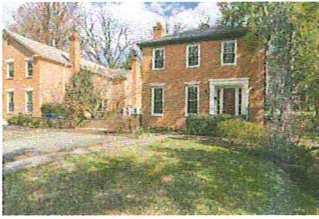
10005 Kensington Pkwy Kensington/Kensington Under Contract List Price - $964,000