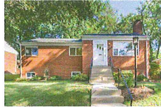
5113 Flanders Ave Kensington/Garrett Park Estates Active - $ 635,000