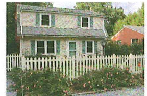
2911 Barker St Silver Spring/Capitol View Park Coming Soon