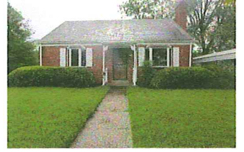
4206 Brookfield Dr Kensington/Kensington Estates Active - $ 619,000