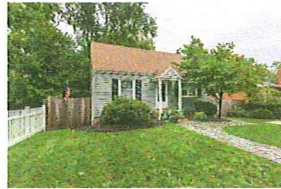
11015 Glueck Ln Kensington/North Kensington Active - $ 489,000