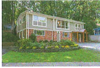
4000 Wexford Dr Kensington/Rock Creek Palisades Active - $ 695,000